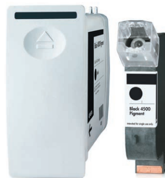
BULK INK CARTRIDGE PRINTHEAD

The AUTOPRINT Ink Management System and the new HP bulk ink cartridge is a convenient, no mess, money-saving solution for high volume packaging applications. The AIMS system and HP bulk ink cartridges can be used with any AUTOPRINT 3-head, 4-head or 6-head printer and a large selection of HP inks for different materials and applications.